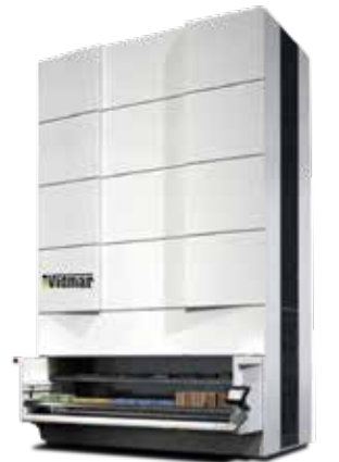
Vertical Lift Module (VLM) Automated Storage & Retrieval System