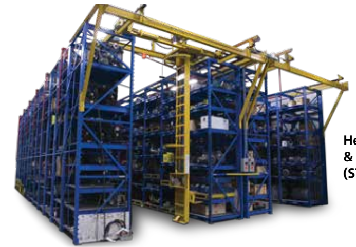
Heavy Pallet Storage & Retrieval Systems (STAK System)