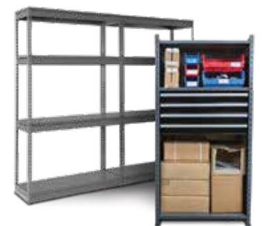
Shelving and Shelf Converter