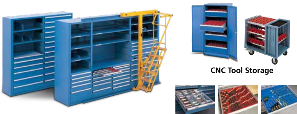
Wall Systems (Storage Wall®)