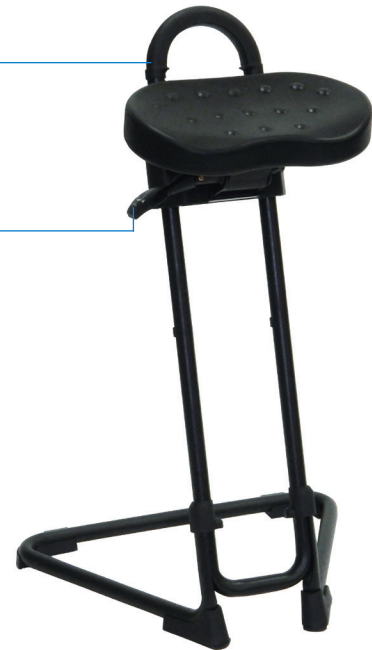
Height Range: 24”-34” Seat Dimensions: 14” x 8”