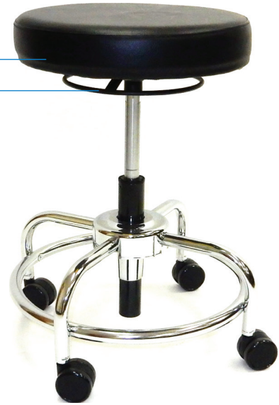
Height Range: 18" - 24" Seat Dimensions: 14" Round Back Dimensions: NA