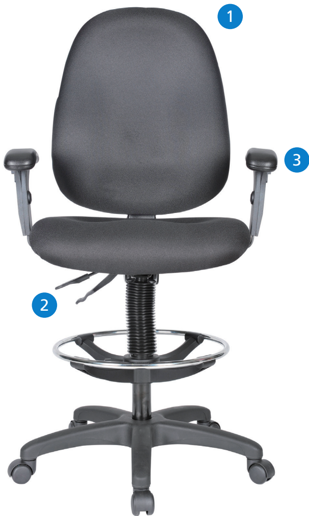
High-back Back Dimensions: 18 1/2" x 21 1/4"

Feature: Heavy-duty construction Seat capacity of 300 lb. Benefit: Designed for multiple shifts.