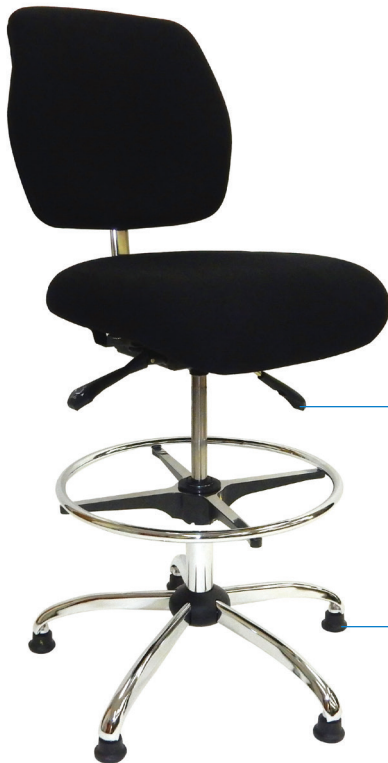
Height Range: 22" - 30" Seat Dimensions: 18 1/2" x 18 1/2" Back Dimensions: 16 1/2" x 15 1/2"