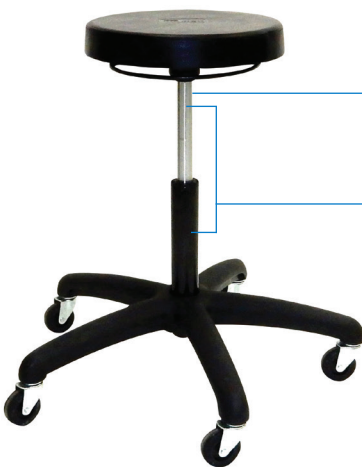
Height Range: 19" - 27" Seat Dimensions: 13" Dia.