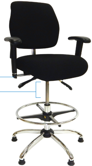
Height Range: 22" - 30" Seat Dimensions: 18 1/2" x 18 1/2" Back Dimensions: 16 1/2" x 15 1/2"