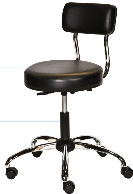
Height Range: 17" - 22" Seat Dimensions: 14" Round Back Dimensions: 12" x 6"