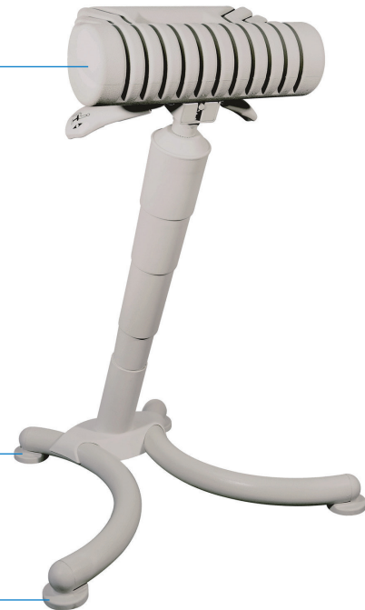
Height Range: 26" - 35" Seat Dimensions: 12 3/4" x 3.5" Back Dimensions: NA