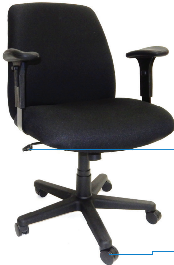
Height Range: 19" - 22" Seat Dimensions: 22" x 20" Back Dimensions: 21" x 20"