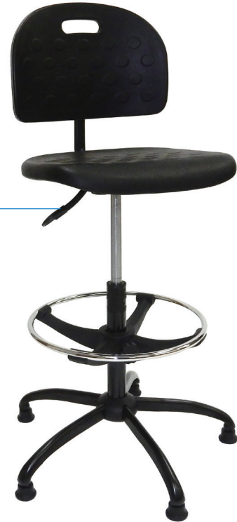
Height Range: 22" - 32" Seat Dimensions: 18 1/2" x 16 1/2" Back Dimensions: 17" x 12"