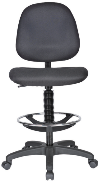
Mid-back Back Dimensions: 18 1/2" x 17 3/4"