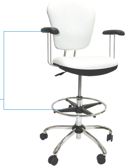
Height Range: 21" - 28" Seat Dimensions: 18" x 16 1/2" Back Dimensions: 17" x 15"