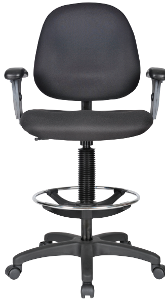
Mid-back with Arms Back Dimensions: 18 1/2" x 17 3/4"